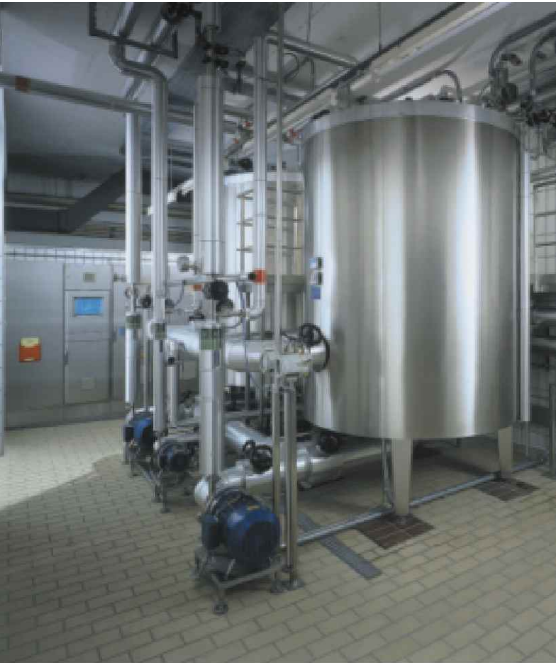
WFI storage and distribution system

The manufacture of pharmaceutical products has to comply with various laws, regulations and the GMP guidelines of WHO, PIC, EC, FDA. Authority acceptance is of prime importance for pharmaceutical companies and hospital pharmacies.